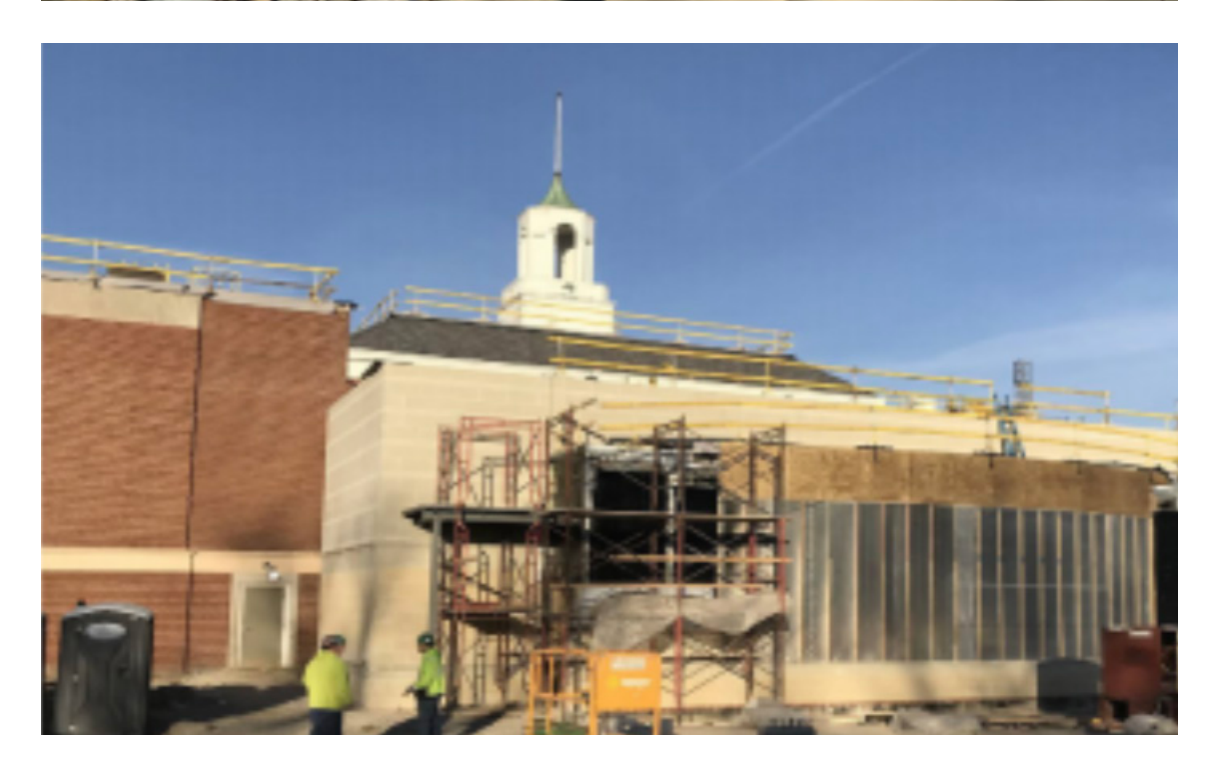
New construction additions to the new intermediate school building on E. Washington St.