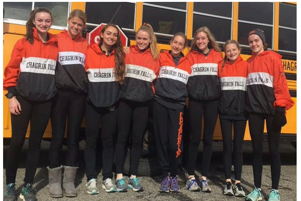
Girls' cross country paid homage to the 1991 state championship team with their warm-ups at the 2018 State Cross Country Meet. The girls finished 9th overall.