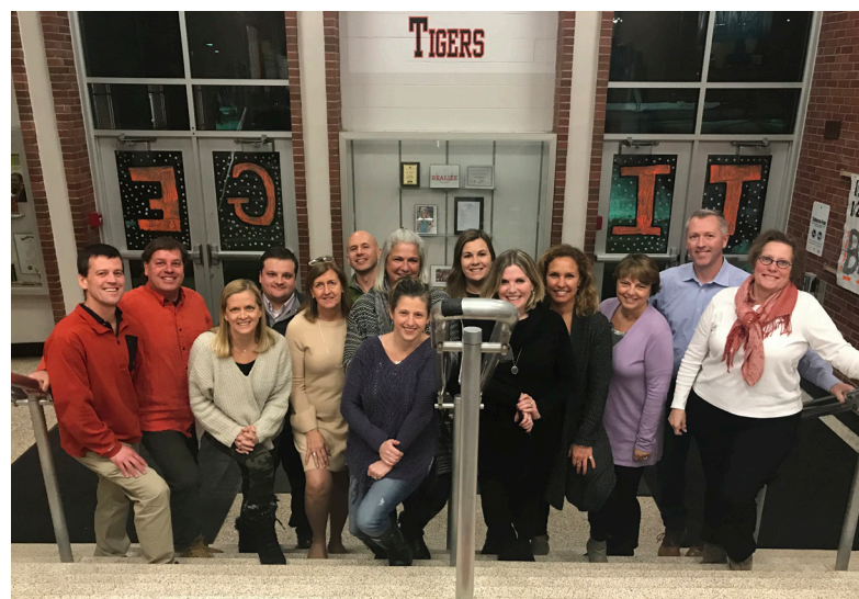
2019 Officers and Trustees (Left to Right)